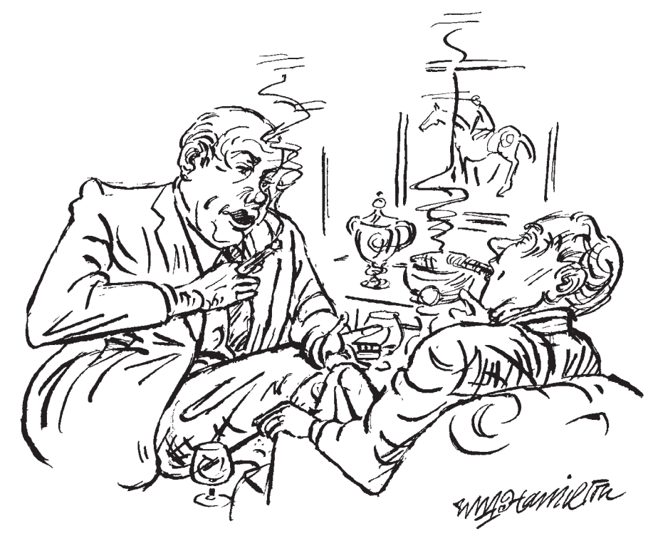
"Sure, money may be imaginary—but at least it's got everybody imagining it."